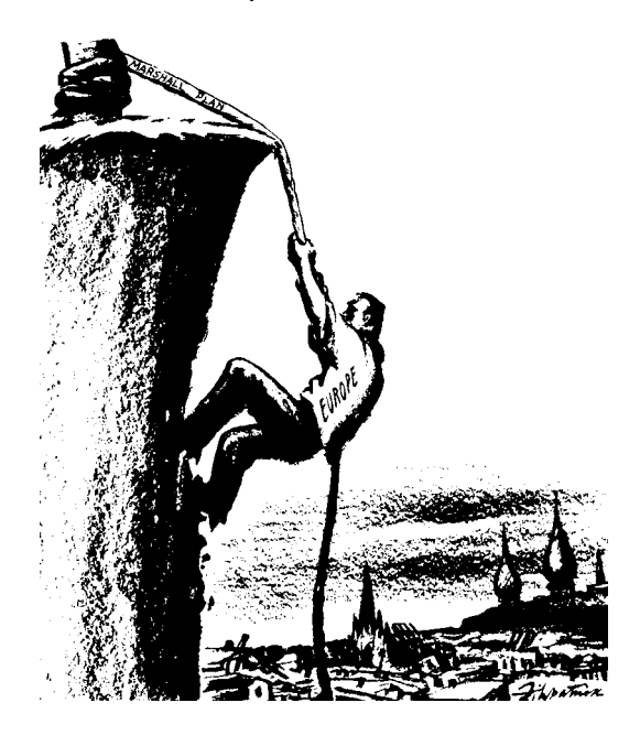
An American cartoon, showing the Marshall Plan giving help to Europe.

7 Study the cartoon, and then answer the questions which follow.