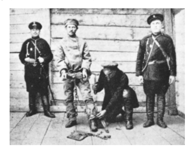
A prisoner of the Okhrana, the Tsarist secret police.

11 Study the photograph, and then answer the questions which follow.