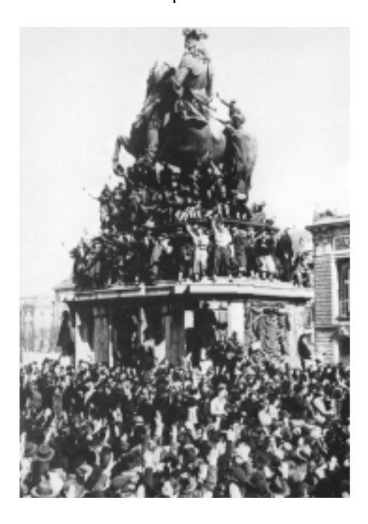
Enthusiastic Viennese demonstrate in favour of the Anschluss, 12 March 1938.

6 Study the photograph, and then answer the questions which follow.